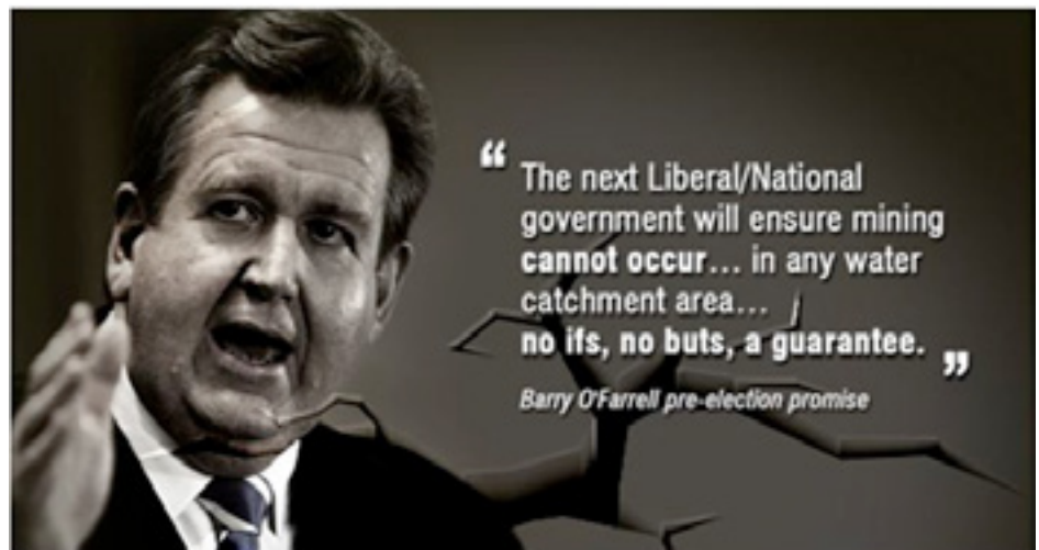
A clearing in the forest 27 January 2013

When the current Premier of NSW asked us to trust that "the next Liberal/National government will ensure that mining cannot occur ... in any water catchment area ... no ifs, no buts, a guarantee" many including the NSW National Party would have taken him at his word. Read More.