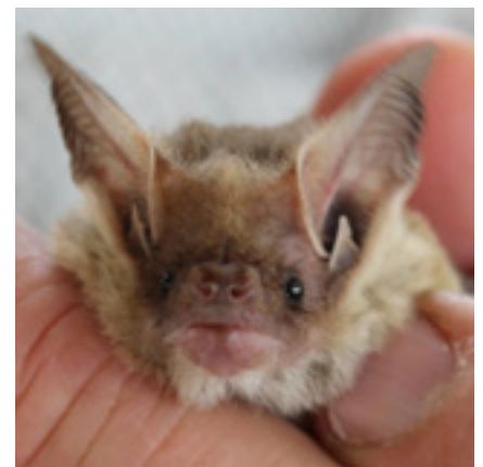
Endangered Corben Long-eared bat

“As the Prime Minister reminded everyone last week, ‘...we do know that over time as a result of climate change we are going to see more extreme weather events’. Read more