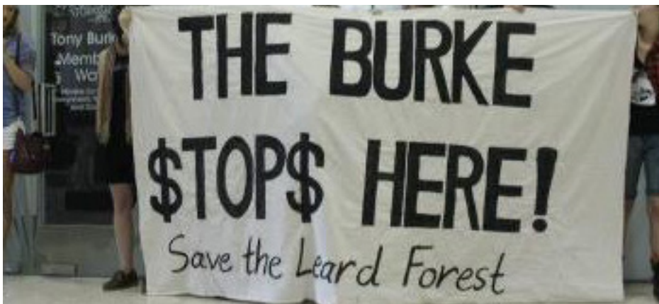
Protesters taking their message to Tony Burke's electorate office.