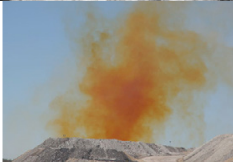
Leard Forest January 2013.