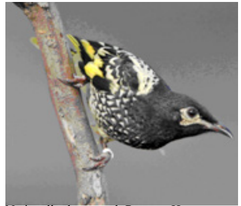
Nationally threatened: Regeant Honeyeater