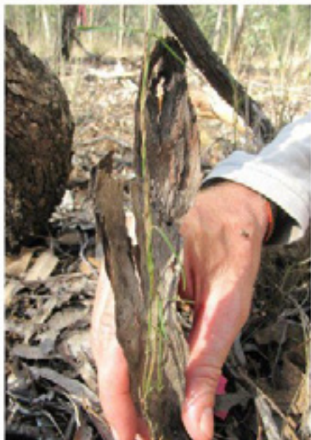
Endangered Plant: Tylophora linearis