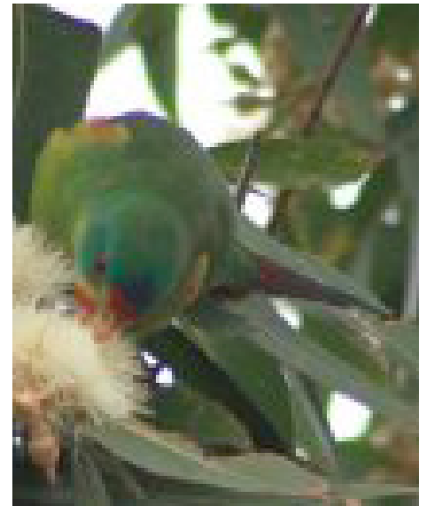
Nationally threatened: Swift Parrot