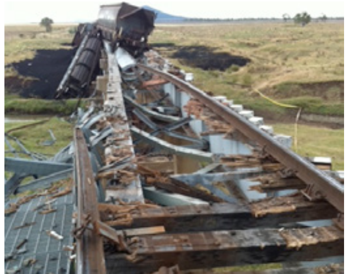
Boggabri Coal Train Derailment - Rail line out of action.

There is currently an education campaign you can take part in to let ANZ know that you do not agree they should lend to Whitehaven and thus provide the funds for the company to destroy the local koalas and Leard Forest. Send a message here.